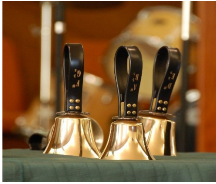
This Photo by Unknown Author is licensed